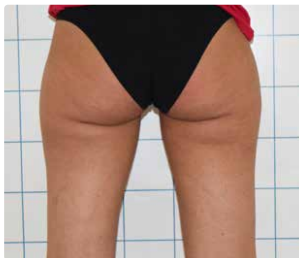
60 Days After Treatment