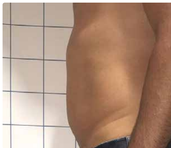
40 Days After Treatment