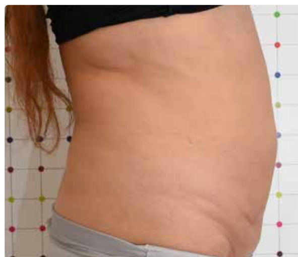
45 Days After Treatment