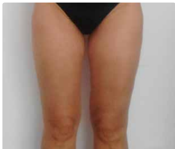
30 Days After Treatment