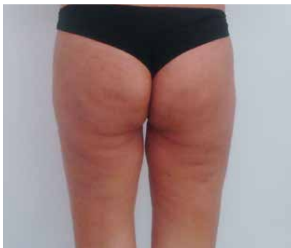
30 Days After Treatment