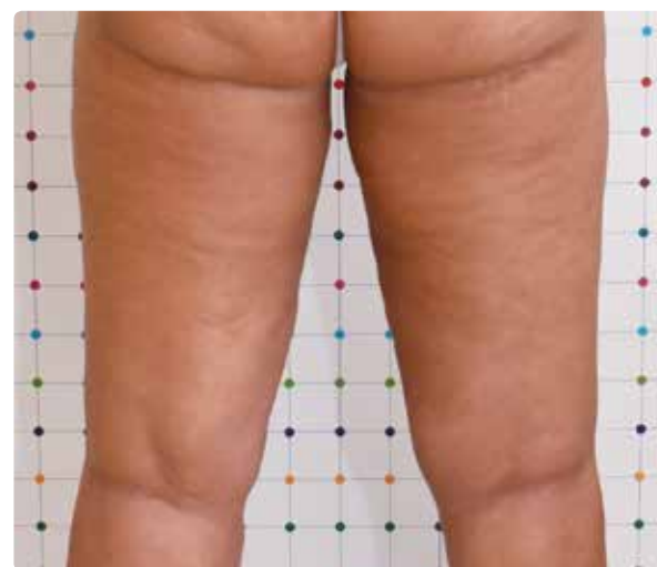
60 Days After Treatment