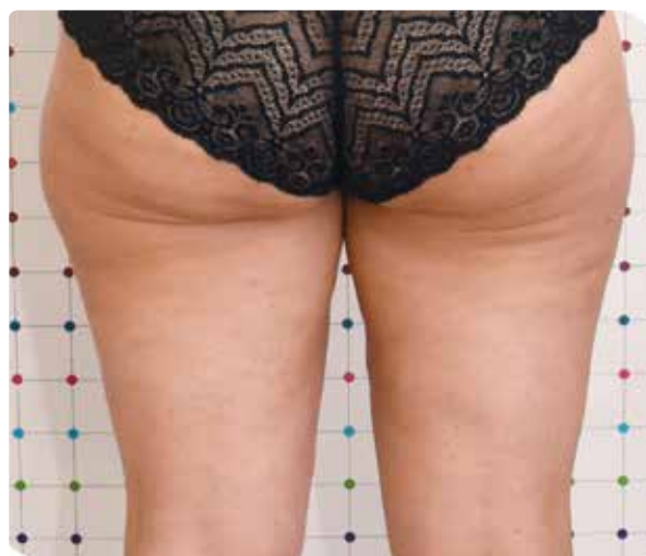
80 Days After Treatment