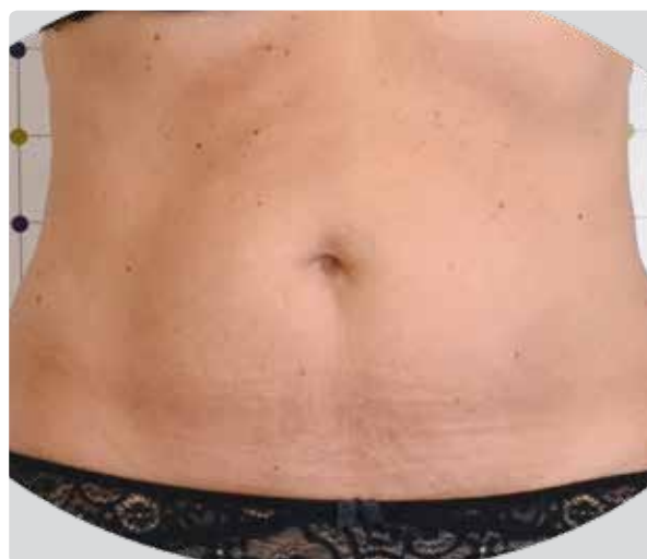
60 Days After Treatment