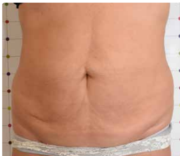
45 Days After Treatment