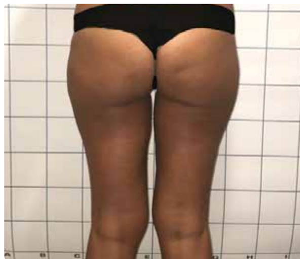
90 Days After Treatment