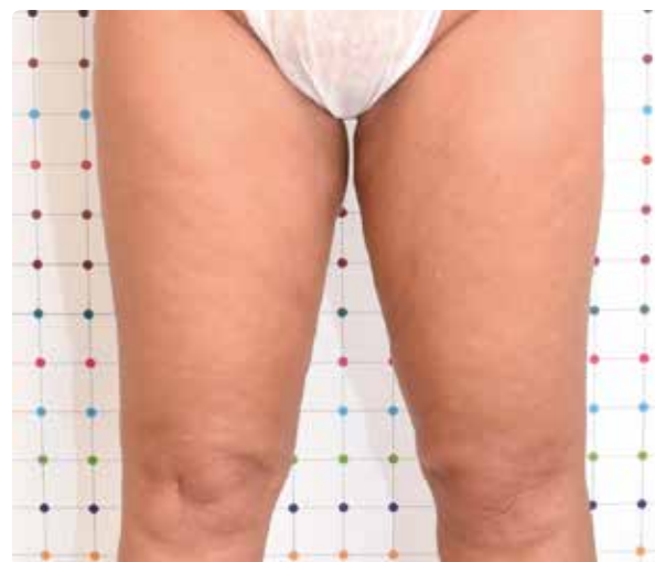
60 Days After Treatment