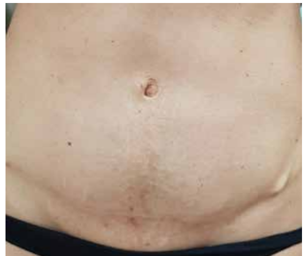
30 Days After Treatment