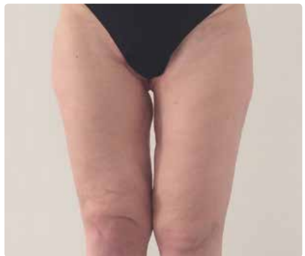
50 Days After Treatment